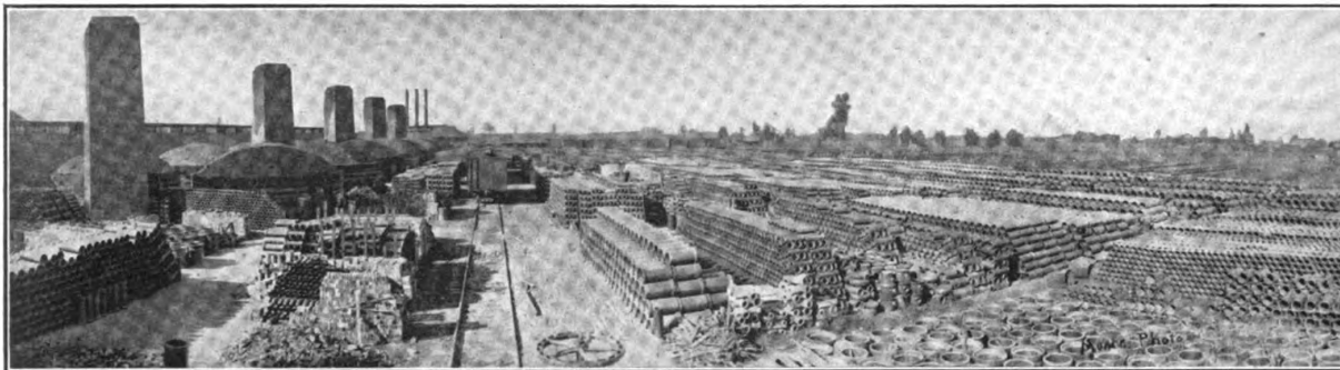
Kilns and Stock Piles of Plant No. 6 of Pacific Clay Products Company.